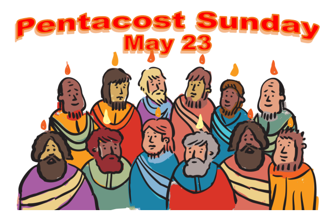
All of them were filled with the Holy Spirit and began to speak in other languages, as the Spirit gave them ability. Acts 2:4 (NRSV)

Please Note: the "Marketplace" will not be held on May 23rd, instead it will be on June 27 between worship services.